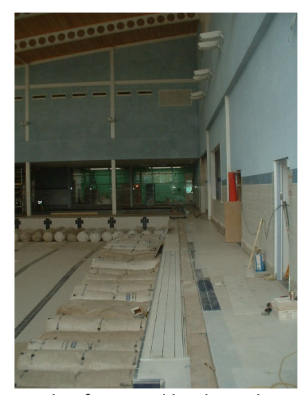
Inside of new Oaklands Pool

Capital Programme Outtrurn was considered with 96% of the 2008/09 Capital Programme having been delivered as part of the strong performance of the council.