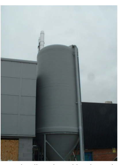
Wood Pellet silo Oaklands Pool